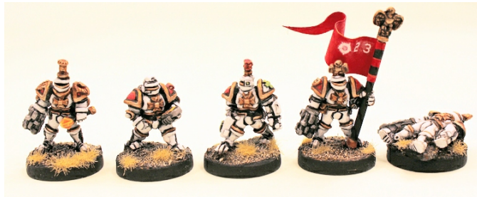
DESTERIA COMMAND AS LORD POMPOUS (IAF075)