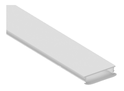
Frosted Diffuser D32