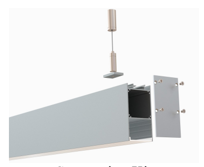
Suspension Kit (Includes 2 steel wires of 1.5m/4.92ft and connection parts)