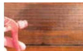
FINISH LOST IT'S WATER REPELLENCY