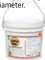
Exterior Protects exposed log ends

30-40 sq.ft. per gallon. One gallon will coat approximately 180 log ends with 6" diameter.