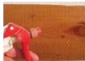
FINISH REPELS WATER

For more detailed questions about exterior maintenance contact any Perma-Chink Systems branch.