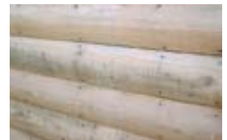
Dark colored streaks caused by metallic tannates. Oxcon solution will also remove rust stains caused by nails, screws and fasteners.