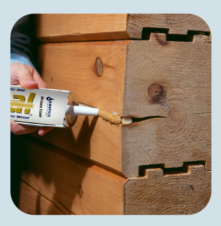
2 – Gun Conceal® over the backer rod.