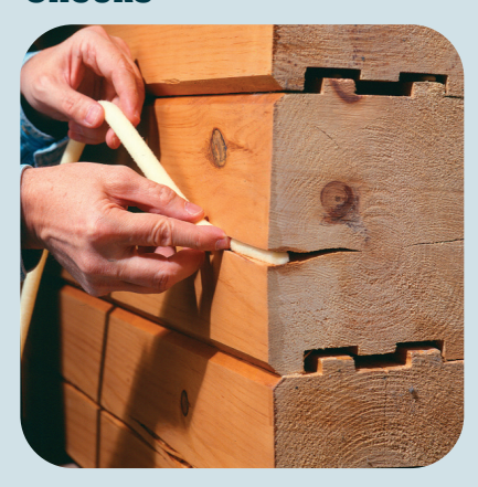
1 – Install backer rod into a clean, stained check to the appropriate depth. (See Fundamental Application Guidelines.)