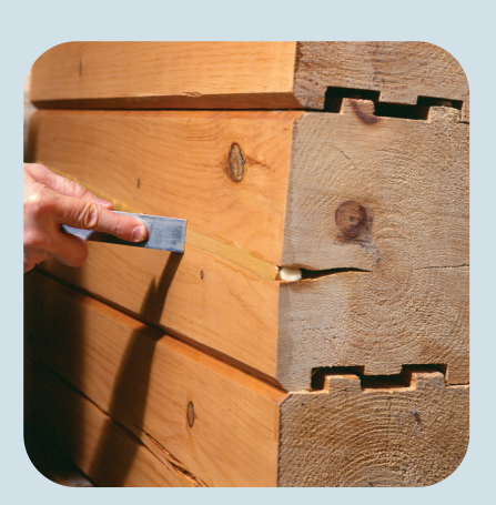
3 – Tool Conceal<sup>®</sup>.