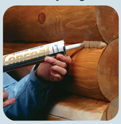
1 – Gun Conceal® into clean, stained joints.