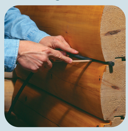
1 – Install backer rod into the caulk well of clean, stained logs.