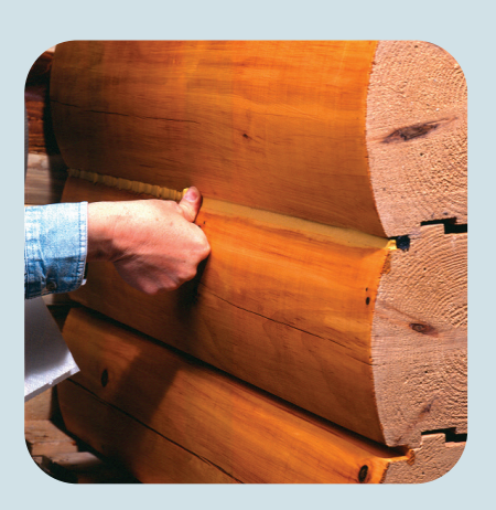
3 – Tool to ensure a tight seal to the top and bottom of the caulk line.