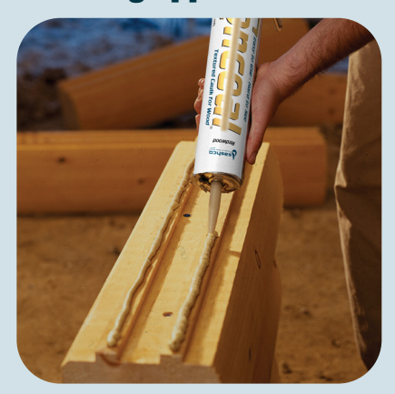
Apply bead(s) according to the log home manufacturer's instructions. Stack the next log and repeat. Don't allow caulk to skin over prior to stacking.