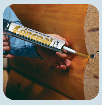
2 – Gun Conceal® over the backer rod.