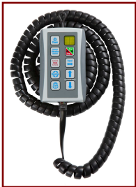
TABLE MODEL OPTIONS: