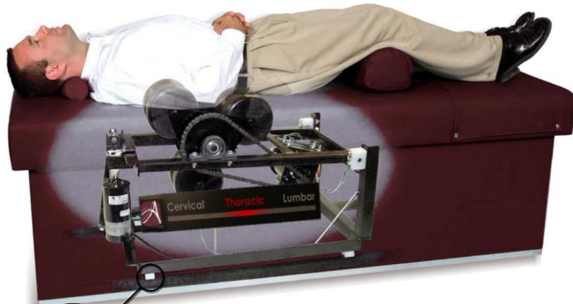
MODEL SHOWN: AMQ400