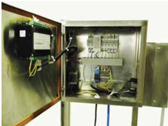
Control Panel Detail