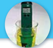
Table 1 provides the oxidizing (disinfecting) range of the most popular sanitizing agents in the industry. The higher the Oxidation Reduction Potential (ORP), the higher the disinfecting ability. This is measured in millivolts (mV).