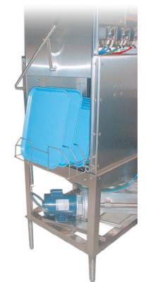
20.5" Door Clearance