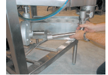
Swift Plumbing Removal