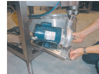
Quick Service Pump