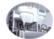
Solid Chemical Dispensing