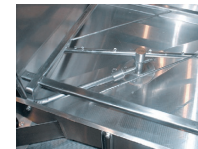
Stainless Bases etc.