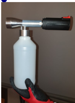
Take the fogging device attachment.