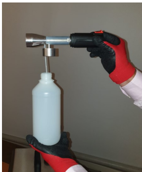
Unscrew the bottle from the attachment