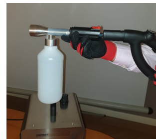
Re-attach the fogging bottle to the attachment.