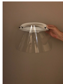
Always wear a face visor when using the fogging device.