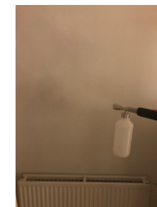
Always start fogging the furthest away from the entrance/exit of the room and always away from