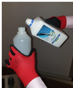
Fill the bottle with the recommended chemical.