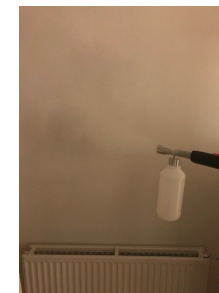
Always start fogging the furthest away from the entrance/exit of the room and always away from