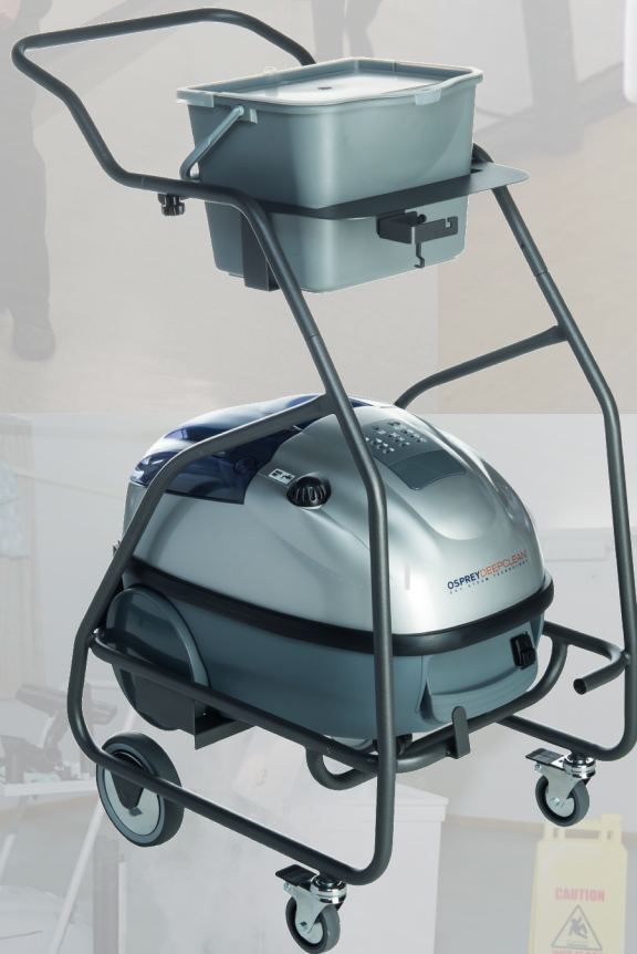
Steam & Vac Pro