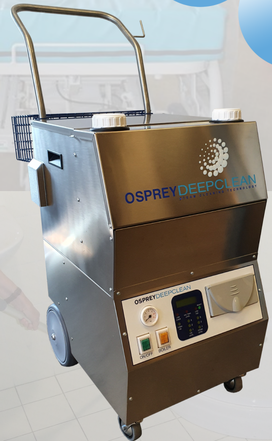
Provap Evo Vac