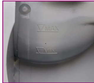
Fill the waste bucket with water between minimum & maximum marks