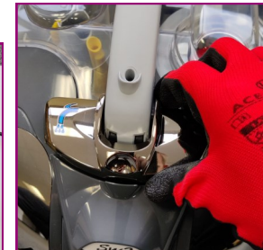
Remove reservoir filler cap