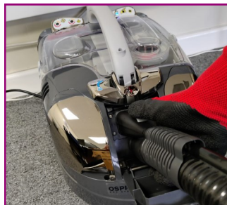
Open the front panel and connect the steam hose.