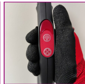
Control the steam volume output using the pistol grip.