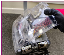
Remove the transparent cover and waste bucket