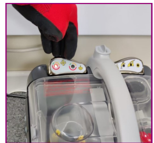
Pressing the left paddle turns the vacuum on & off.