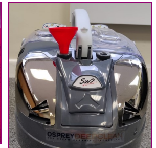
Fill boiler with 1.5 litres, maximum, of cold tap water using a funnel.