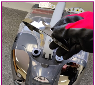
Replace reservoir filler plug.