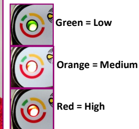
Lights will indicate power level.