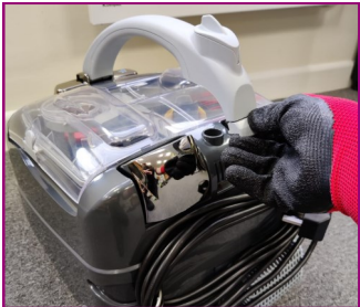
Lift the handle up and away using the clip at the back