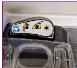
Wait approximately 4 minutes until the blue light is steady