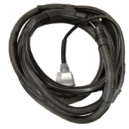
4m Steam & Vac Hose