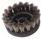
60mm Round Stainless Steel Brush