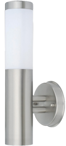
TORRE2 (SS / Wall Light)