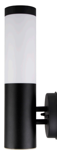
TORRE1 (Black / Wall Light)