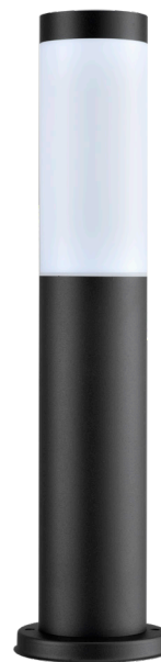
TORRE3 (Black / Bollard Light)