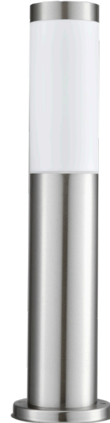
TORRE4 (SS / Bollard Light)