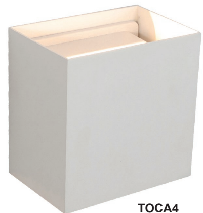
TOCA4 (Matt white)