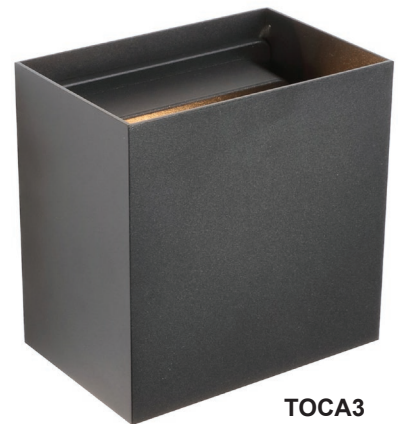
TOCA3 (Matt black)