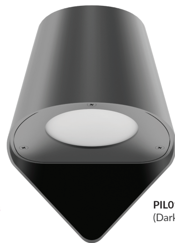
PIL01 (Dark Grey)