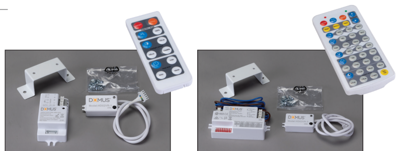
Internal ON/Off Sensor