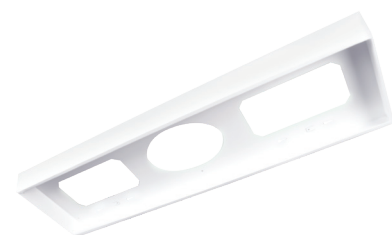
SM Kit (Surface Mounted Frame)