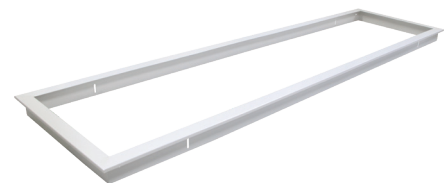
LED Panel Trim (Recessed Plaster Frame)