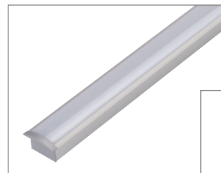
Brushed Aluminium Finish