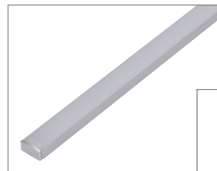
Brushed Aluminium Finish