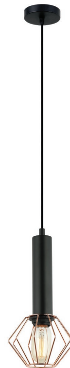
CORAZON1 (matt black/ copper cage diamond)