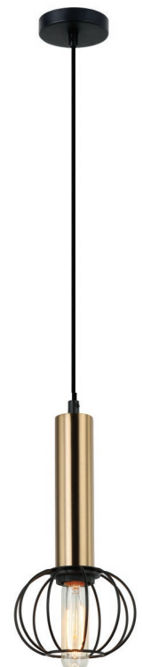
CORAZON2 (antique brass/ matt black cage round)