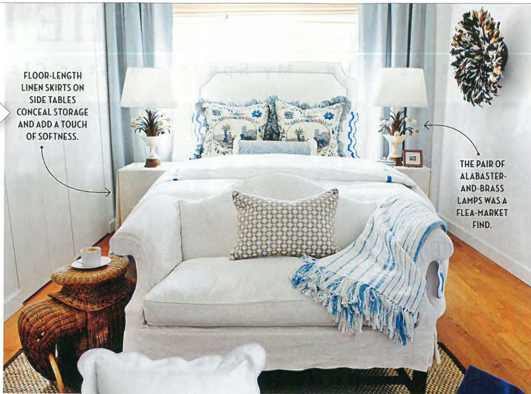
FLOOR-LENGTH LINEN SKIRTS ON SIDE TABLES CONCEAL STORAGE AND ADD A TOUCH OF SOFTNESS.