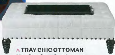
▲ TRAY CHIC OTTOMAN "Perfect for a family room—prop your feet on it or sit on it. The tray in the center also pulls out." bunnywilliamshome.com