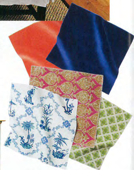
▲ MOHAIRS AND PRINTS "I love the rich colors and textures of Clarence House mohairs. They're durable yet luxe. Great for sofas." clarencehouse.com. "I'm such a fan of Raoul Textiles' updated colorways and classic patterns. They go easily from city to country." raoultextiles.com

WE SENT LINDSEY TO SHOP ETHAN ALLEN. HERE'S WHAT SHE FOUND! ethanallen.com