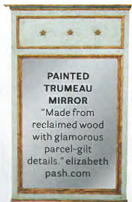
PAINTED TRUMEAU MIRROR "Made from reclaimed wood with glamorous parcel-gilt details." elizabeth pash.com