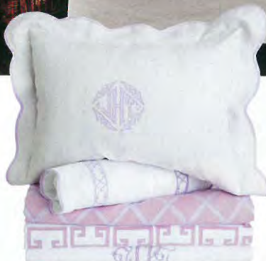
< PURPLE AND PINK BED LINENS "These colors together are so pretty and fresh. You can almost smell the crispness." leontine linens.com