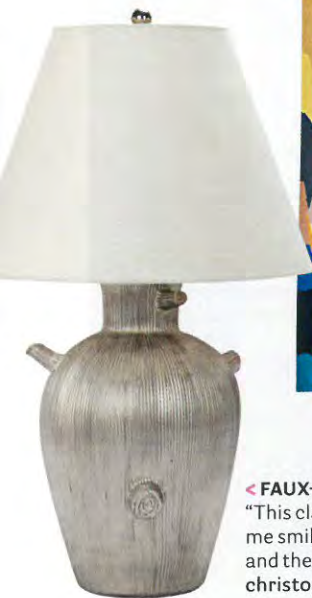
< FAUX-BOIS LAMP "This clay piece makes me smile. I love its whimsy and the coppery glaze." christopherspitzmiller.com