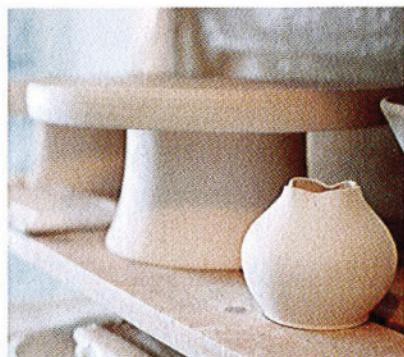
Cake plates and vases before they're glazed.