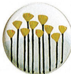
Dahl makes customized dish sets for wedding registries. Ginkgo leaf plate, $90.