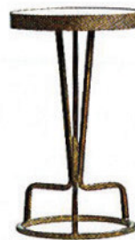
FAR LEFT: Desk, $6,495; chairs, $4,195 each; pillow, $95; mirror, $3,993; lamp, $564. At Celadon. LEFT: Sofa, $15,467; side table, $1,122.