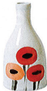
The poppy-print bottle vase is one of Dahl's bestsellers. $40.