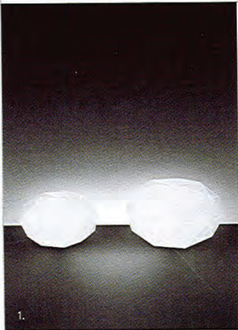
TABLE MATTERS: WAIST-HIGH WONDERS WITH UNEXPECTED SHADE-BASE PAIRINGS

BRIGHTEN YOUR HOME AS WINTER WINDS DOWN with functional, stylish and innovative lighting. Ranging from traditional to modern, these fixtures promise to shed some light on your rooms from floor to ceiling and everything in between.