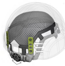
2. Nape dog legs to adjust height of nape pad