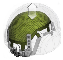
3. Crown net straps to adjust crown height