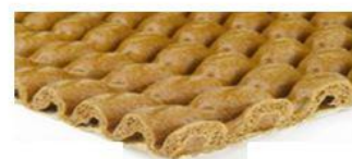
Pocket type underlay is better for under-floor heating systems