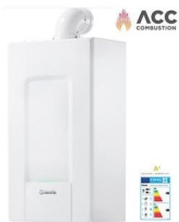
Beretta Mynute X

Advanced high performance inverter heat pumps all the features and competitively priced.