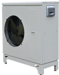
IQ Eco + Logic

Advanced high performance inverter heat pumps all the features and competitively priced.