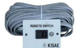
Remote Switch (optional)