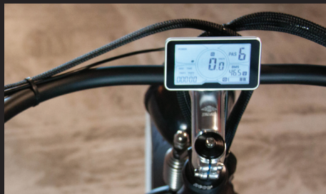
1: The lowest - 6: The highest