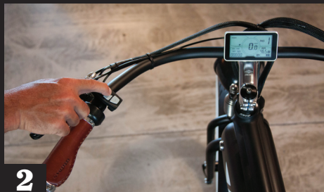
2 Press + button for desired level of assistance (1-6 levels)