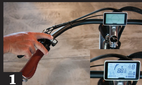
1 Press power button