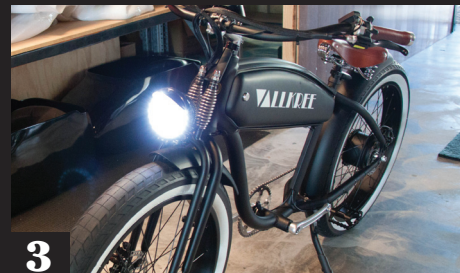
3 Press the power button again to turn on headlight