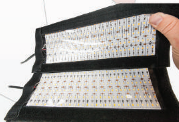
Combining 2 or more ML.6 Sleeves together