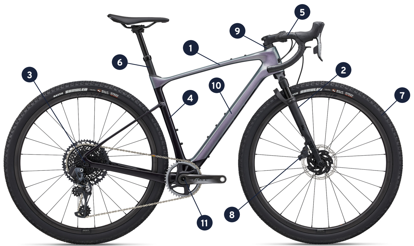
Revolt X Advanced Pro 0

The Advanced composite frameset is designed with suspension-optimized geometry and paired with a 40mm travel fork, delivering a smooth, controlled ride quality on rugged gravel and dirt. A flip chip on the rear dropout lets you adjust the wheelbase and increase tire clearance up to 53mm. You can use the included dropper/suspension post, switch to a proprietary Giant D-Fuse seatpost for added compliance, or use a standard 30.9mm round seatpost. A Contact SL XR D-Fuse handlebar further minimizes fatigue by absorbing shocks and vibrations.