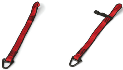
H01055 Tool-Hitch Max Load: 16kg/35lbs

GRIPPS® Tool-Hitches Models: H01055 - H01058