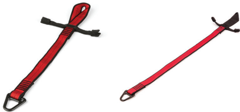
H01057 Dual Arm Tool-Hitch Max Load: 16kg/35lbs