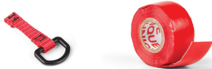
H01007 Tool Catch (Non-Conductive) Max Load: 1.0kg/2.2lbs