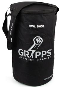
H01112 Zip-Lock Bag Max Load: 30kg | 66lbs