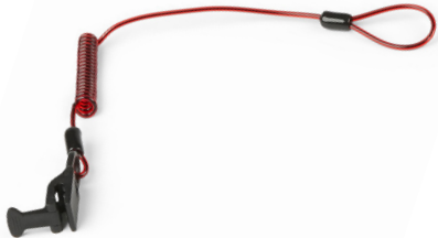
H01075 / H01075-10 Coil Hard Hat Tether (Non-Conductive) Max Load: 0.5kg / 1.1lbs Max Length: 86cm / 34" ANSI/ISEA 121-2018 COMPLIANT