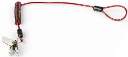
H01070 / H01070-10 Coil Hard Hat Tether Max Load: 0.5kg / 1.1lbs Max Length: 86cm / 34" ANSI/ISEA 121-2018 COMPLIANT