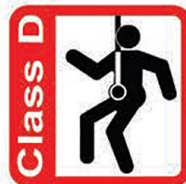
Controlled Descent & Suspension