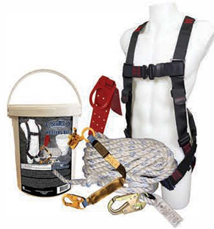
KOALA BEHR With Anti-Panic Quick Connect Buckles And 5 Point Adjustment