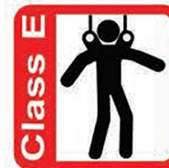
Limited Access (Retrieval)