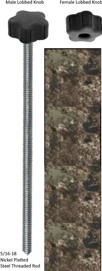
2.5" X 9" Stealth Strip