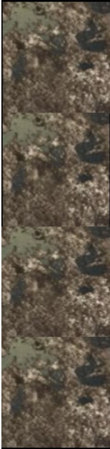
5/16-18 Nickel Plated Steel Threaded Rod