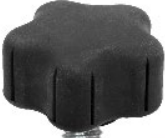
Female Lobbed Knob