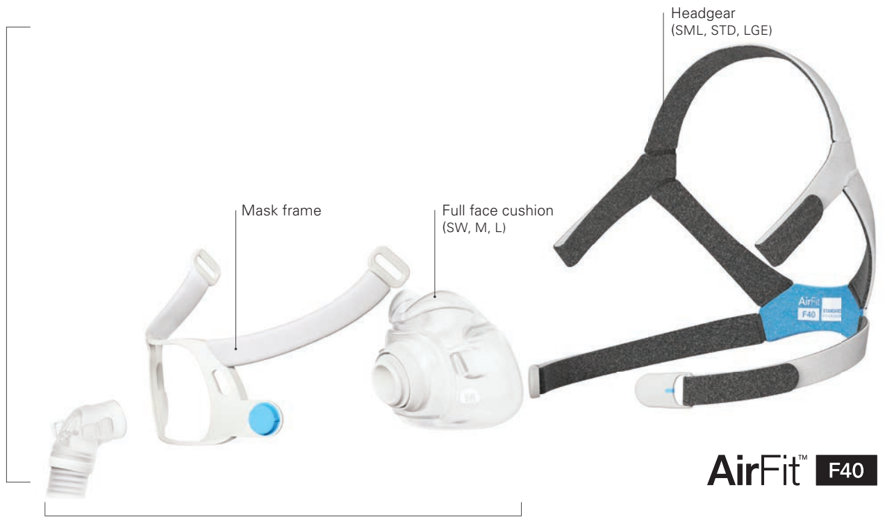
Frame system 64607, 64608, 64609