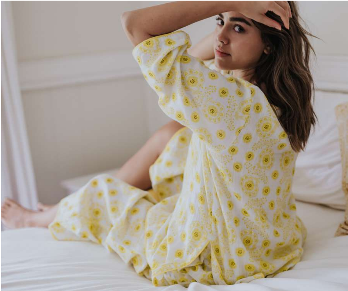
Roadside Daisies PJ Lounge Set