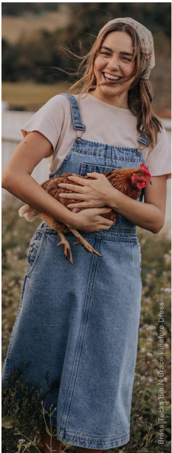
Brass Tacks Bib N Brace Pinafore Dress