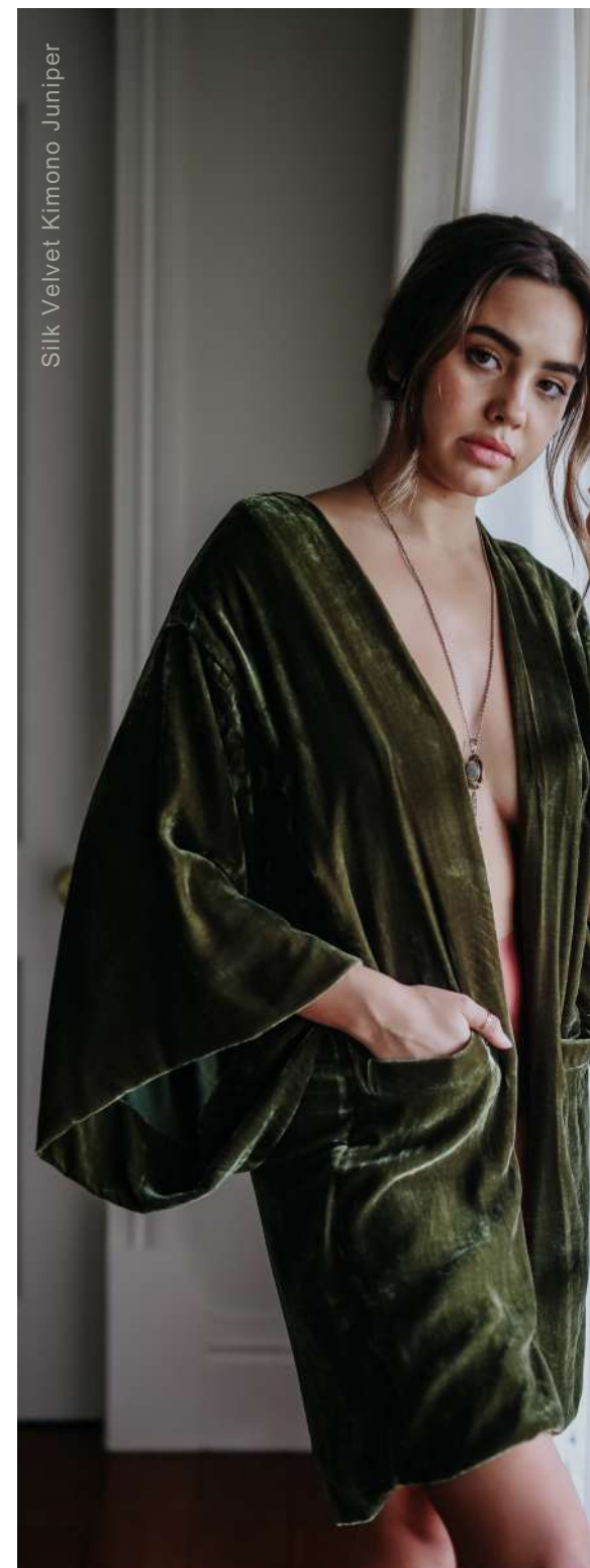
Silk Velvet Kimono Juniper