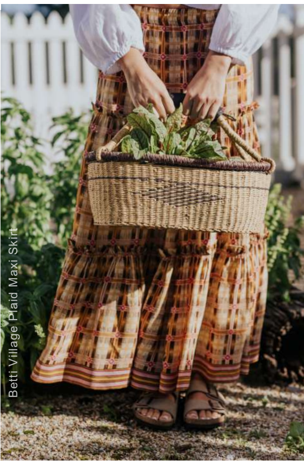
Betti Village Plaid Maxi Skirt