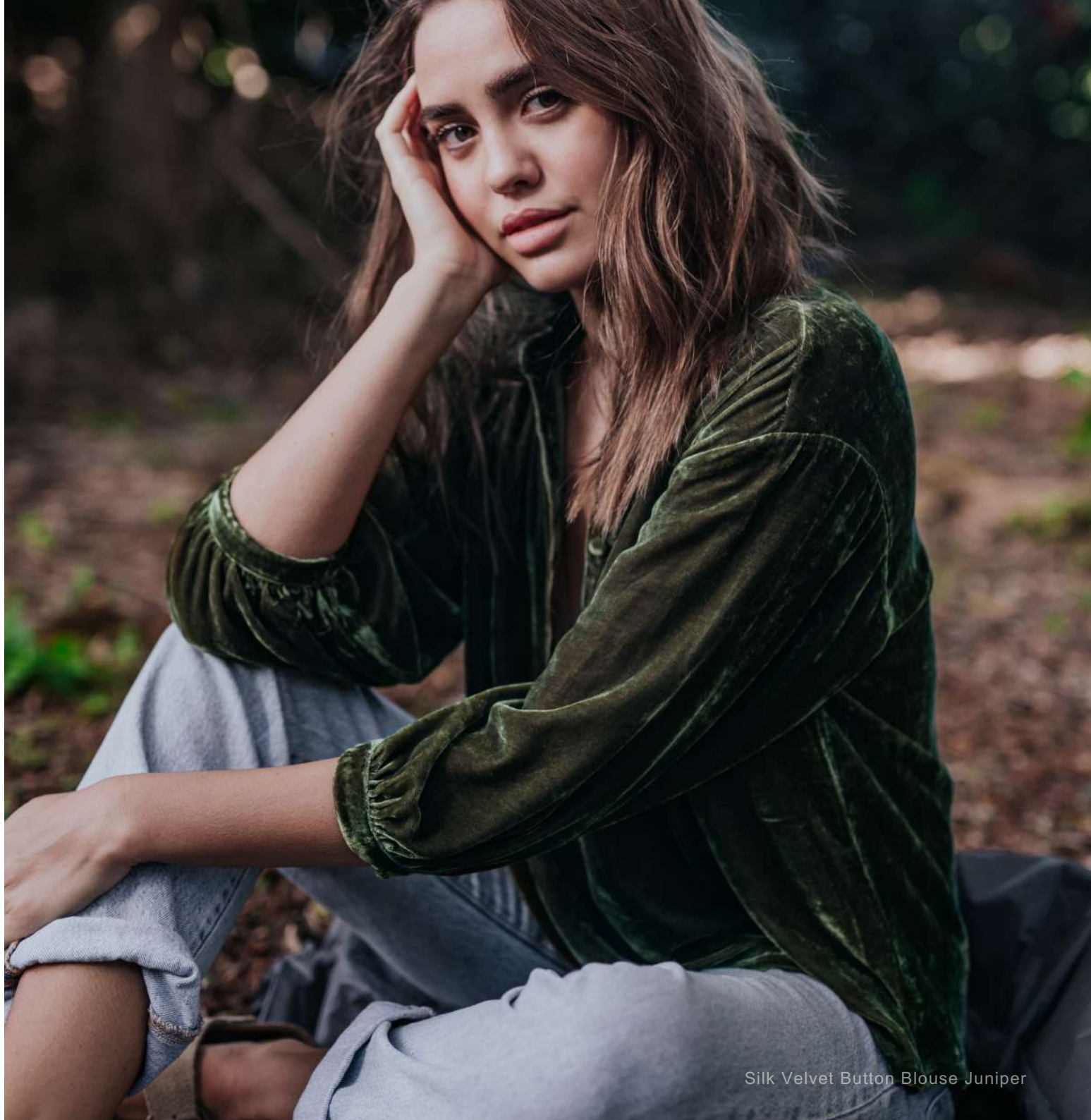
Silk Velvet Button Blouse Juniper