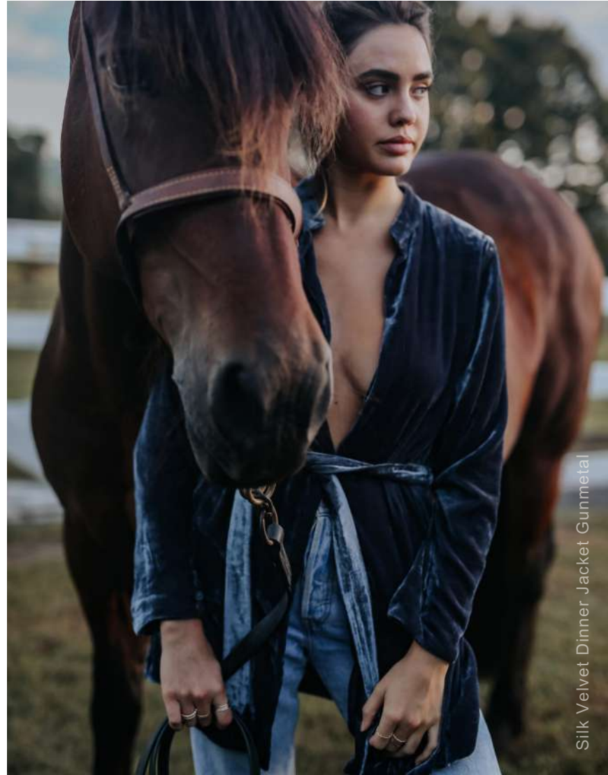
Silk Velvet Dinner Jacket Gunmetal