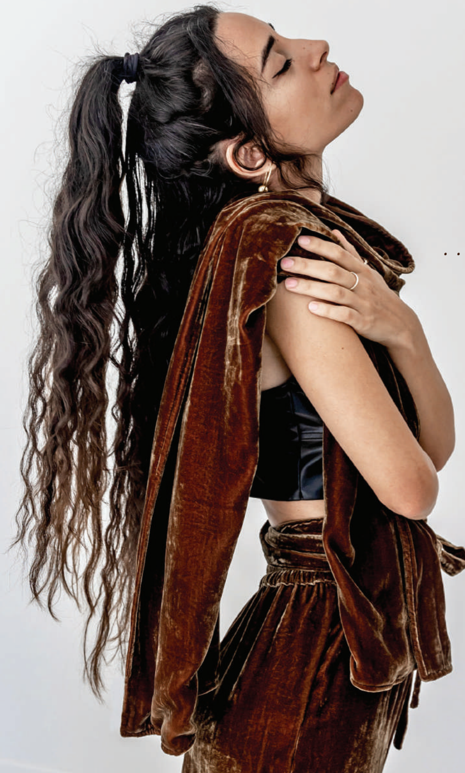
silk road wrap scarf sandalwood