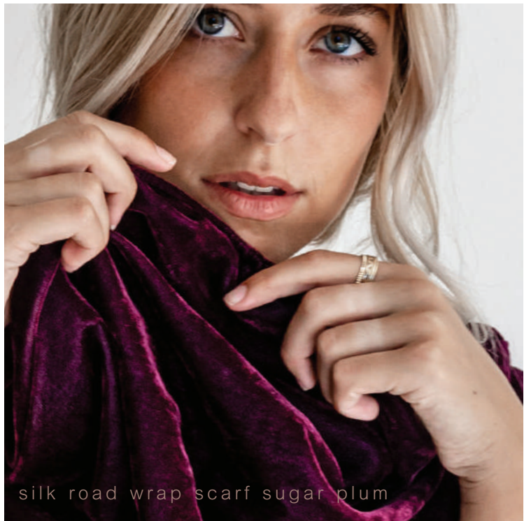
silk road wrap scarf sugar plum