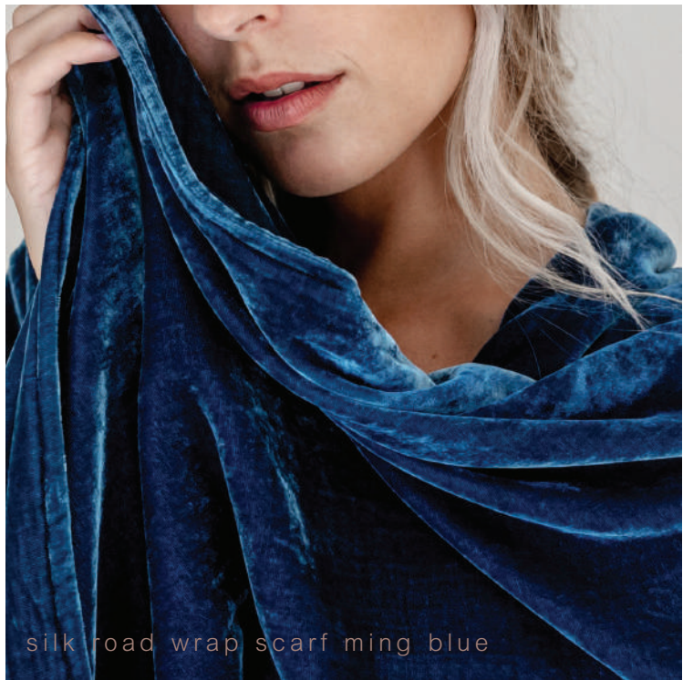
silk road wrap scarf ming blue