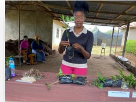
TCB Cupping Average (AA,AB,PB)

$8,400 was invested in 2023 enabling 120 additional farmers (576 total) to learn how to plant, how to care for the trees and how to pick and process the coffee to ensure higher quality and production. While climate has been a big factor in recent years, we continue to see higher cupping scores (the rating of quality) as a result!