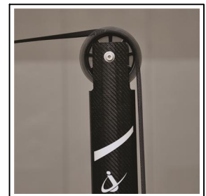
4" DIAMETER POLYCARBONATE PULLEY WHEEL