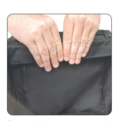
Step 4: With the top wire inside the hook and loop pocket, press the strips together to secure. Repeat Steps 3-4 at the front of the bag.