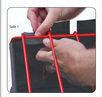
Step 10: On the side, separate the first hook and loop strip, and fold it over the first wire of the red Frame Assembly.