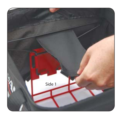
Step 5: On the inside of the bag, pull the protective flap under the top wire of the black Frame Assembly.