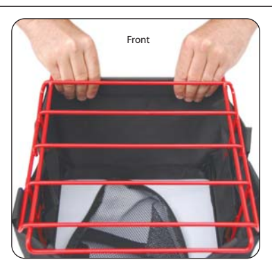
Step 9: Press the hook and loop strip together to secure. Repeat Steps 8-9 on the back of the bag.