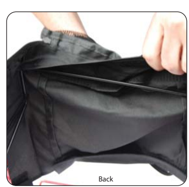
Step 3: Inside bag near the top, separate the hook and loop strips, open the pocket and slide the top wire of the black Frame Assembly inside.