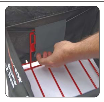
Step 7: On the inside of the bag, press the protective flap against the bottom of the bag to secure the hook and loop closure. Repeat Steps 5-7 on Side 2.