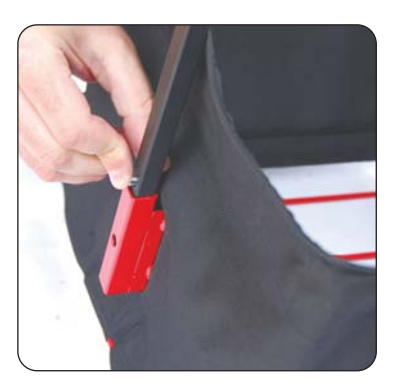
Step 12: On Sides 1 & 2, insert the handle into the red handle receivers, press the buttons in, and continue to push down until the silver button pops through the hole, securing the handle in place.