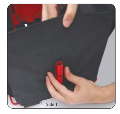
Step 6: Pull the bag opening over the red handle receiver and press on either side to secure the hook and loop strips.