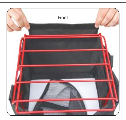
Step 8: Turn the Frame Assembly upside down. At the front, separate the hook and loop strip, and fold it over the first wire of the red Frame Assembly.