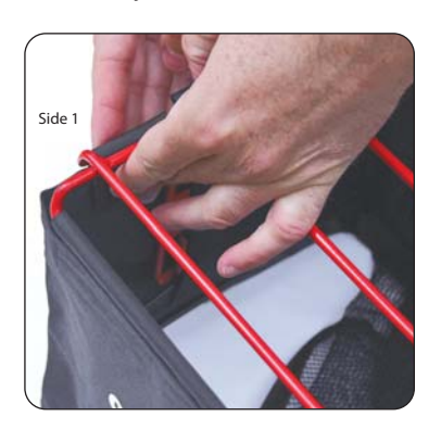
Step 11: Press the hook and loop strip together to secure. Repeat Steps 10-11 for all hook and loop flaps on Side 1 and Side 2. When completed, turn the basket over so it is right-side up.