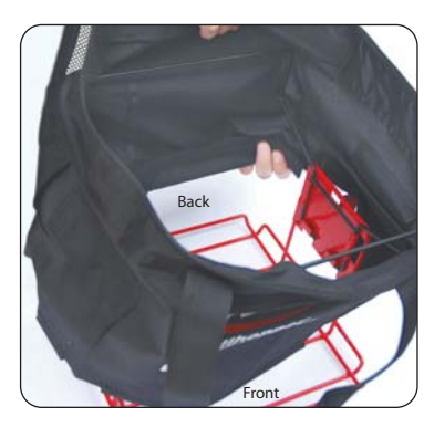
Step 2: Slide EZ Basket 150 Bag over the Frame/Base, with the handles oriented to the front and back of the Base Assembly.