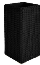
All Weather Rope in Black