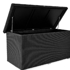
All Weather Rope in Black