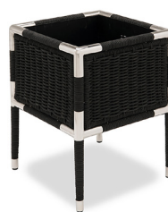
Black Rope with EP Stainless Steel