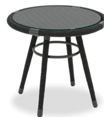
Black Rope with Anthracite Powder-coating and Glass.

This item is carefully packed one per box.