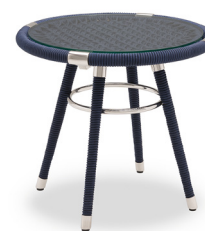
Blue Rope with EP Stainless Steel and Glass.