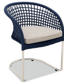
Blue Rope with EP Stainless Steel and Oyster cushion.