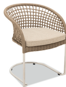
Taupe Rope with EP Stainless Steel and Sandstone cushion.

This item is carefully packed two per box.